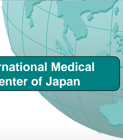
International Medical Center of Japan