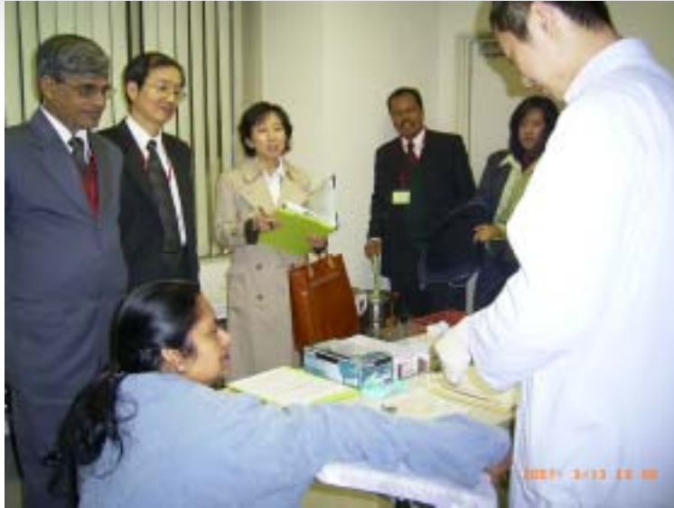
Tokyo Metropolitan Minami-Shinjuku HIV-testing/counseling Room